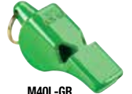
M40L-GR Neon Green