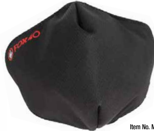
Item No. MASK40 Tri-Layer Whistle Face Mask