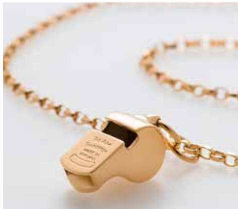
TNSSGP Thunderer Necklace Solid Silver with Gold Plating