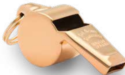
60 1/2GP Gold Plated 60 1/2