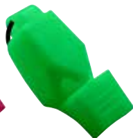
Z40L-CMG-GR Neon Green Fuziun