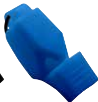
Z40L-CMG-BL Blue Fuziun