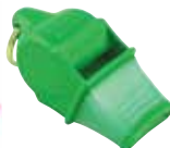
S40L-CMG-GR Neon Green