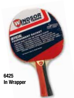
6425 In Wrapper