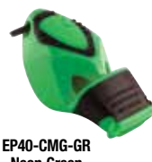
EP40-CMG-GR Neon Green