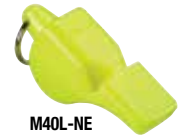
M40L-NE Neon Yellow