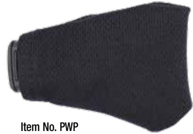
Item No. PWP Protective Whistle Pouch