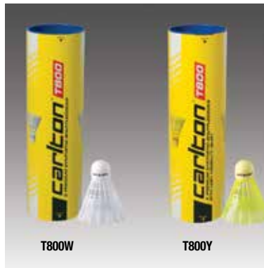
Packaging artwork subject to change.

T800WR Fast (Red) Speed - very hot playing conditions.