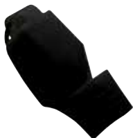
Z40L-CMG Black Fuziun

In celebration of the 30th Anniversary of Fox 40, we proudly introduce the Fuziun CMG whistle! The Fuziun merges two of Fox 40's most popular whistles together, the distinct high pitch of the original Fox 40 Classic with the piercing blast of the Fox 40 Sonik Blast CMG. This dynamic whistle produces the optimal whistle sound power! The Fuziun's 3 chamber design is flawless, consistent and reliable. With two ultra-high frequency chambers to cut through crowd noise, the 3rd lower chamber commands attention. The Fuziun's distinctive shape and sound sets it apart from other whistles. An integrated cushioned mouth grip provides user comfort and durability. The Fuziun produces a whopping sound power of 118 decibels!