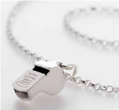
TNSS Thunderer Necklace Solid Silver

The best gifts come in small packages. May we suggest a touch of luxury... Three stunning, fully working miniature replica necklaces of the ever popular Acme Thunderer whistle in Solid Sterling Silver, Solid Sterling Silver with Gold plating, and Solid Sterling Silver with Rose Gold plating. Each necklace comes in an Acme jewelry box, and is Hallmarked at the Birmingham Assay Office in England. A perfect gift for the athlete, coach, teacher or any woman with discriminating taste!