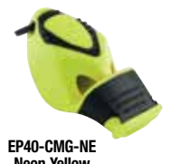
EP40-CMG-NE Neon Yellow