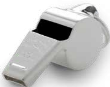
60 1/2SP Silver Plated 60 1/2

Three special editions of the Acme Thunderer 60 1/2 whistle are now available. The ever popular Gold plated, and the Silver plated and Rose Gold plated models. Each whistle comes in its own blue presentation box and makes an excellent gift for a special coach, athlete, or teacher!