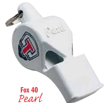
Fox 40 Pearl with logo