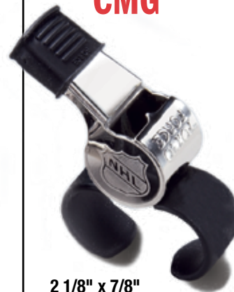
2 1/8" x 7/8"