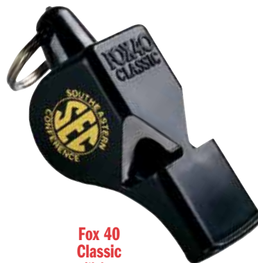
Fox 40 Classic with logo

Almost Any Fox40 Plastic Whistle is available personalized with the name or logo of a store, school, conference, corporation, community, etc. Minimum order of 12 Dozen Whistles per Logo.