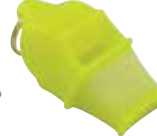
S40L-CMG-NE Neon Yellow